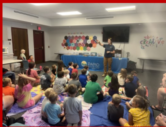
Papio NRD Visit

Springfield Memorial Library would not be where we are today without the unending support of our city and community. On behalf of library staff and the Library Board of Trustees, we want to thank everyone for their support. We offer special appreciation to our dedicated library patrons, visitors, donors and volunteers. A big thank you to city administration, city officials and the city maintenance department for assisting us in making 2024-2025 a very successful year! We look forward to continuing to provide great services and events to our community in the coming year!