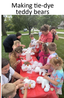
Making tie-dye teddy bears