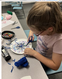
Native American Heritage Day