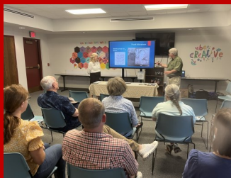
Humanities Nebraska Talk