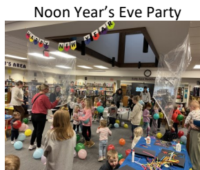
Noon Year's Eve Party