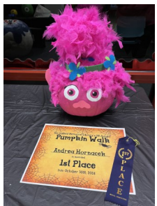
Pumpkin Walk Winner

Springfield Memorial Library also loves getting the community involved in passive programming. This is programming that is not necessarily led by a librarian but remains just as interactive based on patron participation. One of the community's favorite passive programs is our annual Tournament of Books, running each year in conjunction with basketball's March Madness Tournament. The library selects 16 books each year to enter into the tournament and, for several weeks prior to the first match-up, patrons are able to fill out their favorites on the Fantasy Bracket. At the end of the Tournament voting - of course, all of the brackets have been broken - but the person with the most accurate bracket is a winner! During the Tournament, patrons are able to vote on a new book match-up every day, causing the tournament outcome to be completely patron-led, letting them decide on their book champion!