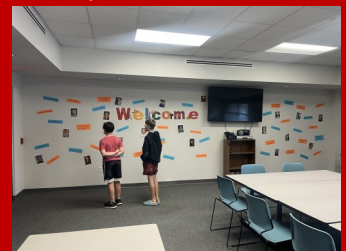
Teen Night: Match the author's name, picture, and book title.