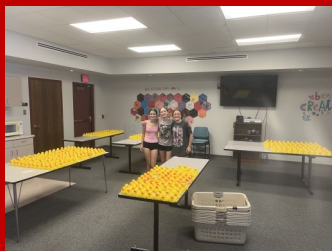
Volunteering to count all the rubber ducks!