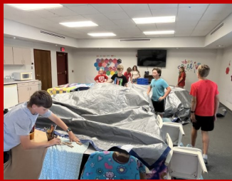
Teen Fort and Movie Day